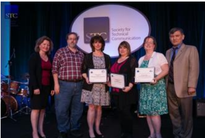
STC Chicago members with Chapter honors at the 2017 STC Summit in National Harbor, MD

Many thanks to EVERYONE involved in making STC Chicago a success! Ω