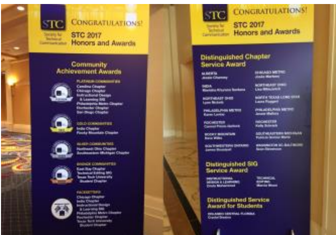
CAA and DCSA honors banners at the STC Summit