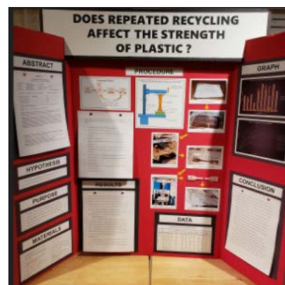
1 st place poster – 2021 (student names withheld for privacy)

Hey, all work and no play doesn't make for a great technical communicator! Congrats and enjoy your award! Ω