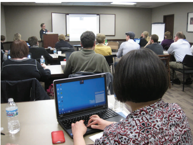
Members learn about Snagit at the February meeting

From the Share tab, users can import captures into various outputs; several new outputs are available. Screencast.com